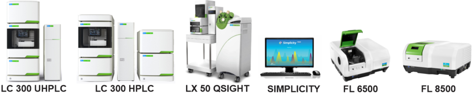
LC 300 UHPLC